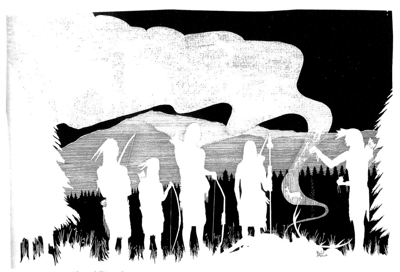
When a kill is made— a deer, an antelope, or a cottontail— the hunters sing songs to the spirit of the animal.

They honor the animal they have killed with their songs because the animal died for them.